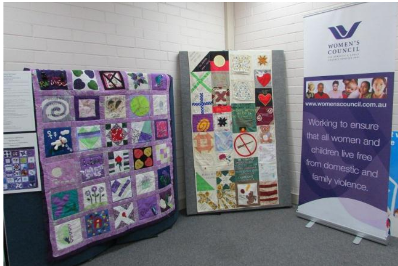
Remembrance Quilt with Western Australian quilt that was made in 1994.