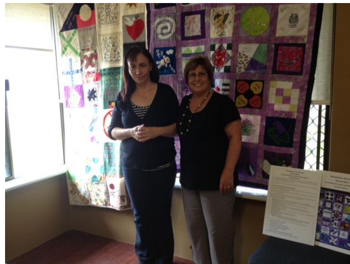
The Lucy Saw Centre provides accommodation for women, with or without children, who are escaping domestic and family violence.