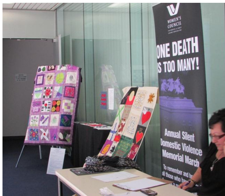
The quilt was displayed in main foyer to the Department for Child Protection lecture theatre and staff canteen.